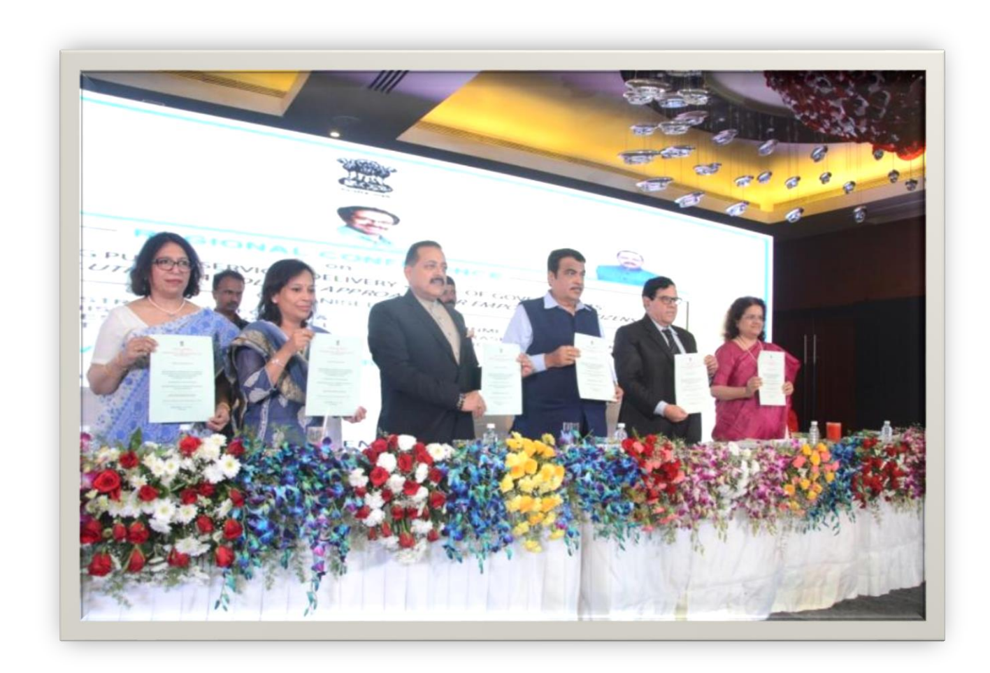
Nagpur Conference Resolution